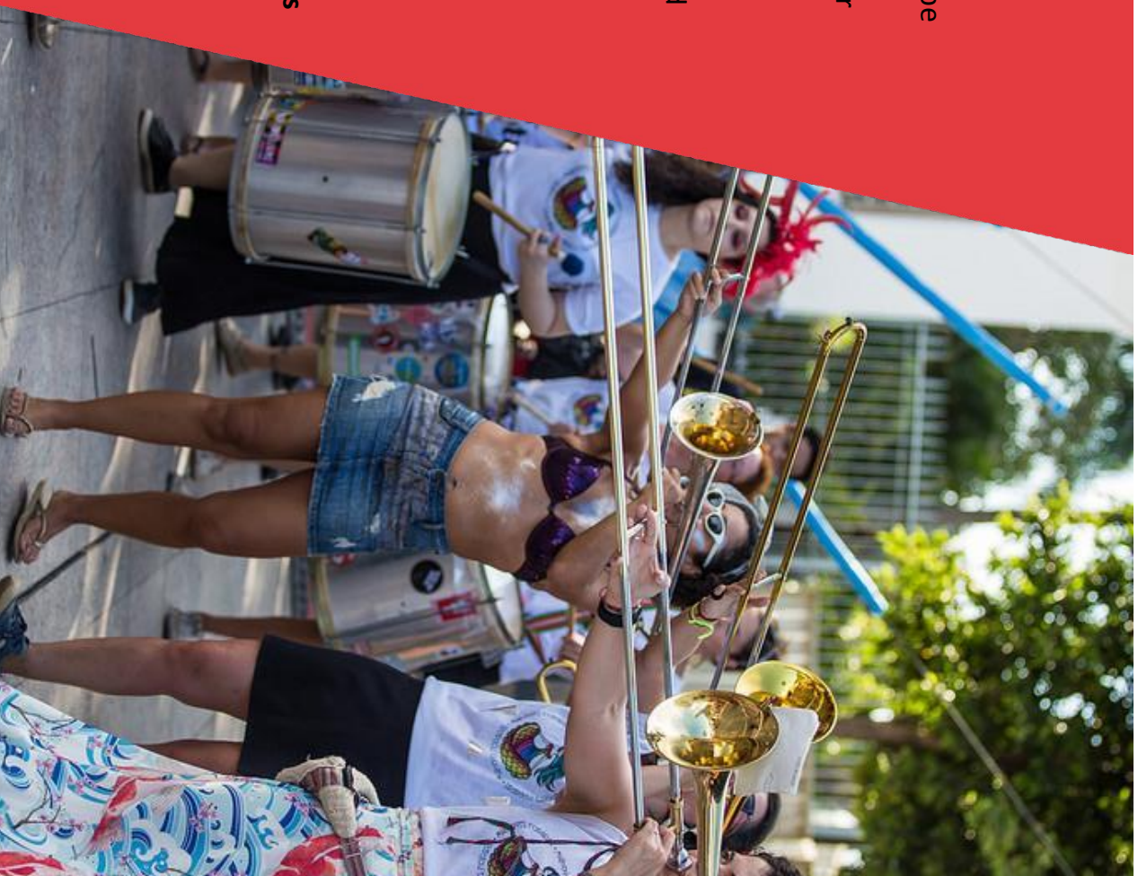
Image: WOW Rio 2018 in full swing in downtown Rio de Janeiro, Brazil

To date, WOW has taken place in Australia, Bangladesh, Brazil, China, Egypt, Finland, Greece, Nepal, Nigeria, Pakistan, Sri Lanka, Somaliland, Taiwan, the UK and the USA where seismic shifts in cultural attitudes towards gender equity have taken place as a result of the festival . Participants have included Angela Davis, Malala Yousafzai, Annie Lennox, Patrick Stewart, Baroness Doreen Lawrence and Salma Hayek - as well as thousands of people who don't have public profiles but are changing the world.