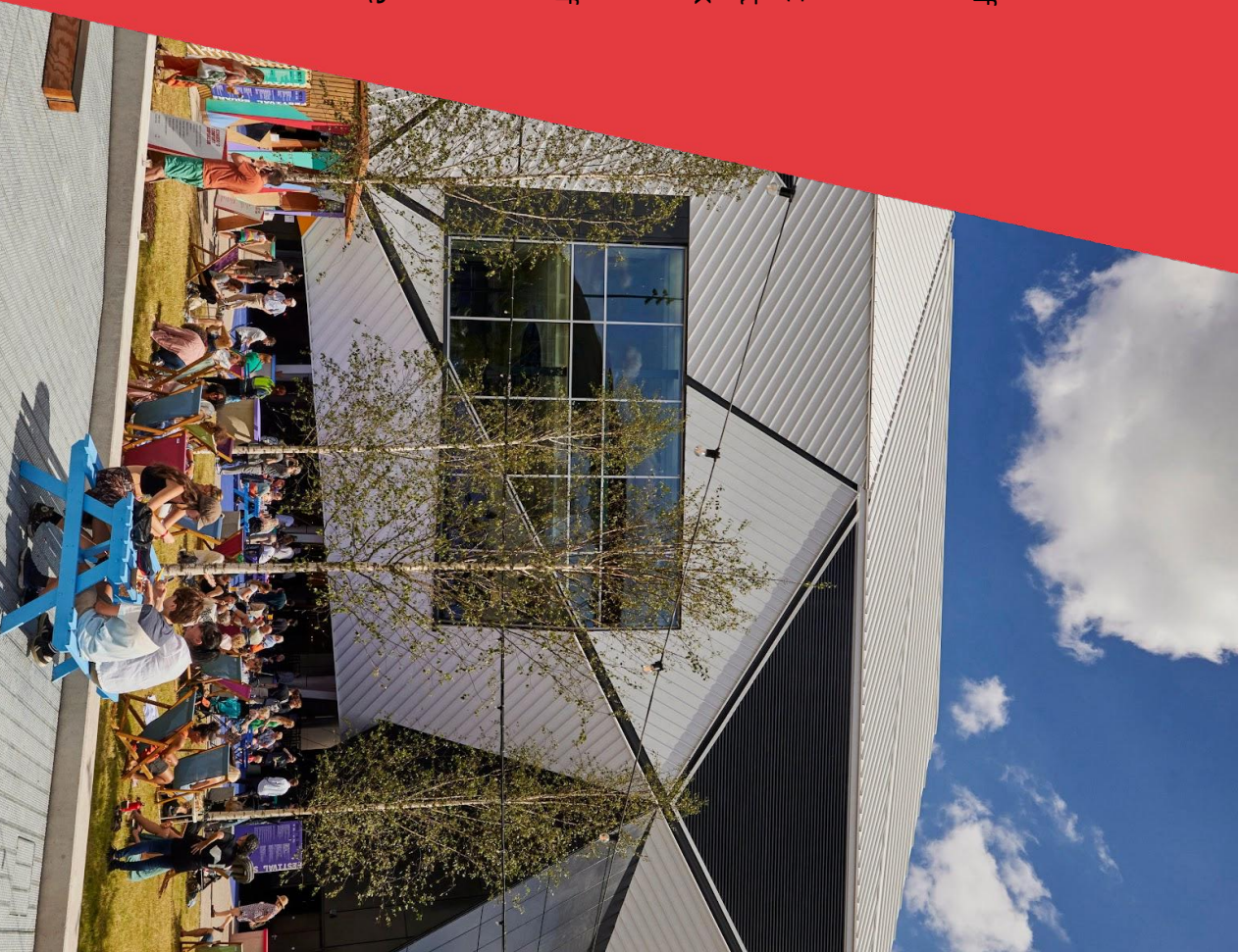
Image: MIF23 Festival Square at Aviva Studios home of Factory International

Factory International plays an important role in the lives of Greater Manchester residents , bringing jobs, skills, training and creative opportunities.