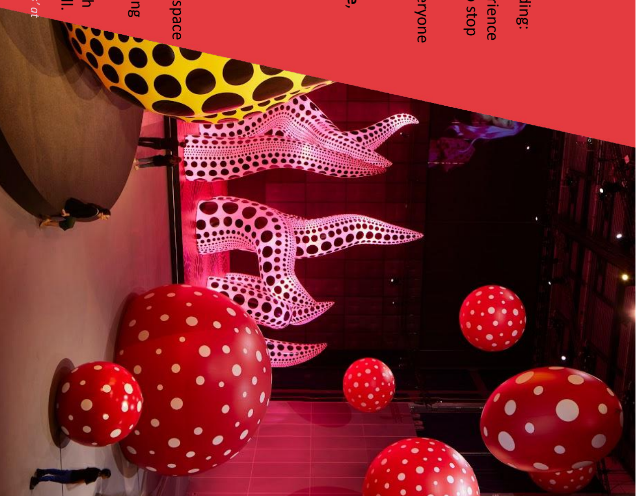
Image: Installation view from Manchester International Festival 2023 exhibition 'Yayoi Kusama: You, Me and the Balloons' at Aviva Studios.