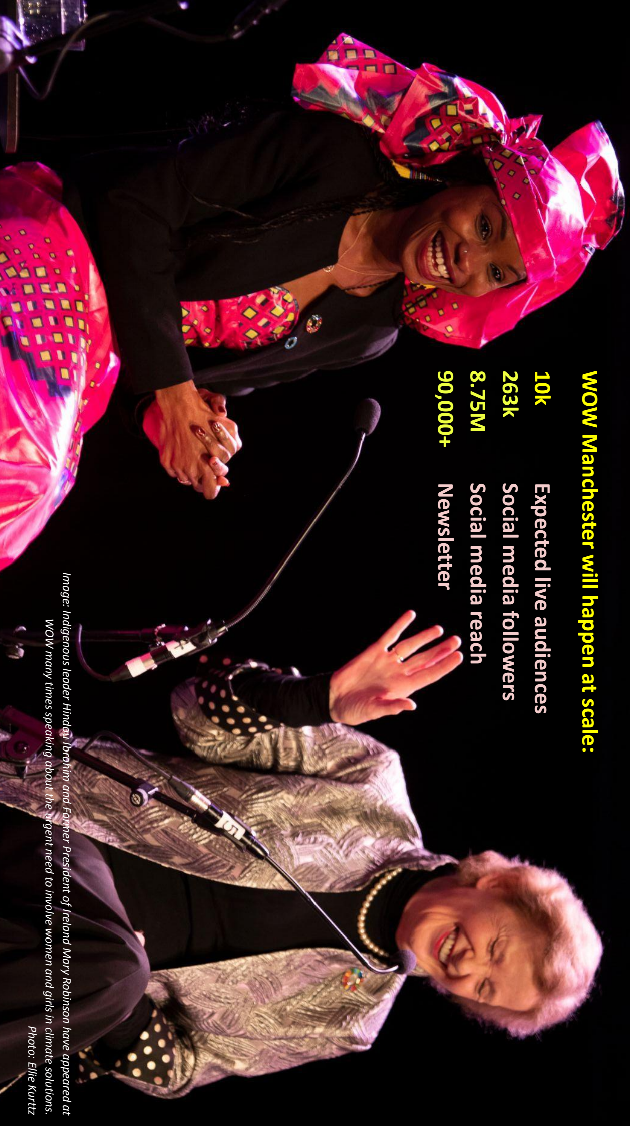
Image: Indigenous leader Hindou Ibrahim and Former President of Ireland Mary Robinson have appeared at WOW many times speaking about the urgent need to involve women and girls in climate solutions.